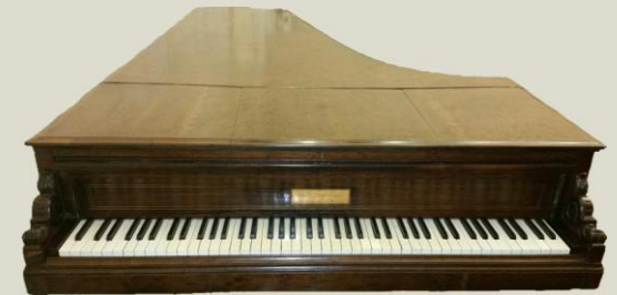
The ANU School of Music's 1847 Pleyel piano