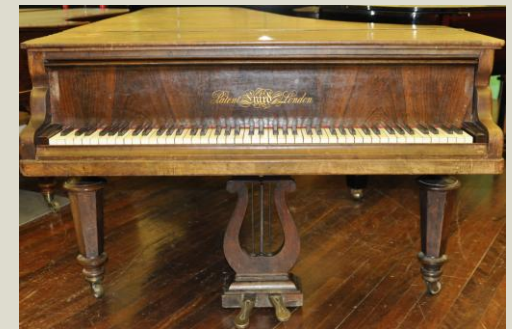
The Friends of Chopin Australia's 1857 Erard piano